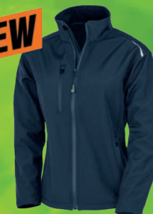
R900F Navy (289)