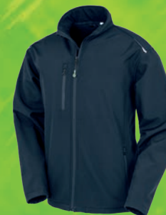
R900M Navy (289)