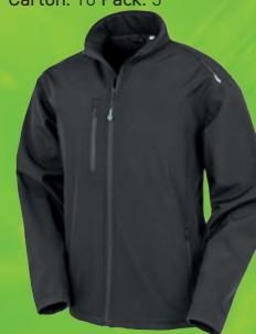
R900M Black (BLK)