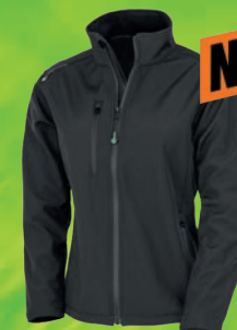
R900F Black (BLK)