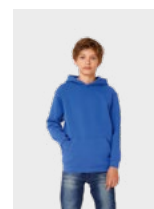
EXISTS IN KIDS: B&C HOODED /KIDS